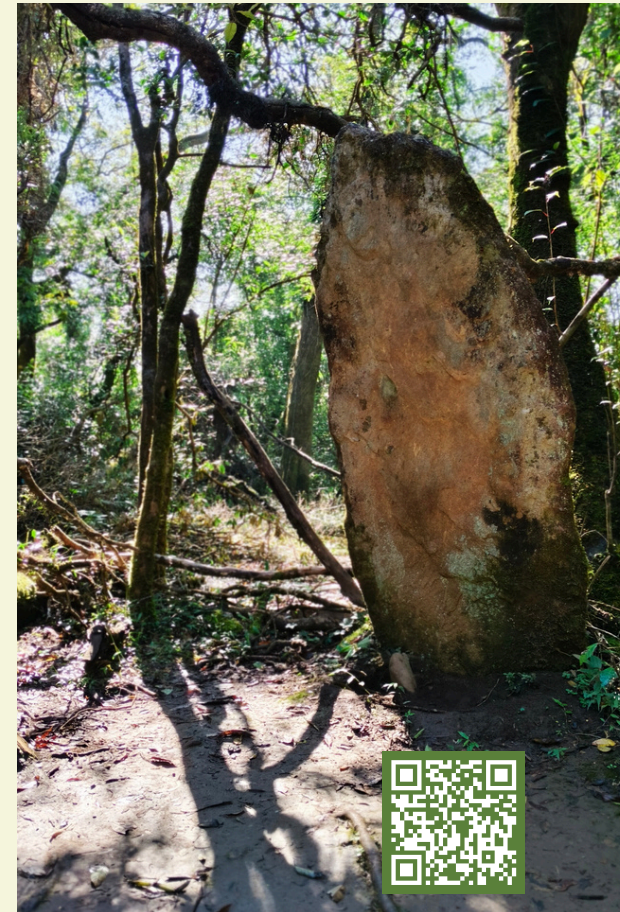
Sacred grove traditions